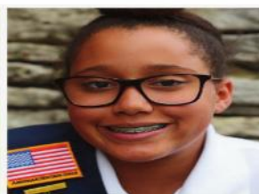
PIONEER Ages 12-14