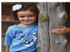
PATHFINDER Ages 5-6

To learn more about American Heritage Girls, please visit www.americanheritagegirls.org