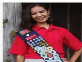
PATRIOT Ages 14-18