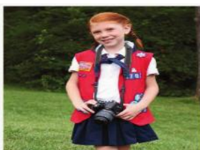
TENDERHEART Ages 6-9