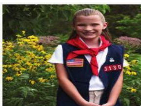
EXPLORER Ages 9-12