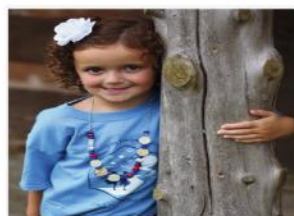
PATHFINDER Ages 5-6

To learn more about American Heritage Girls, please visit www.americanheritagegirls.org