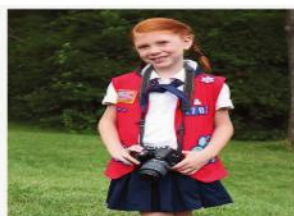
TENDERHEART Ages 6-9