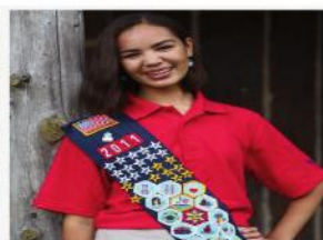
PATRIOT Ages 14-18